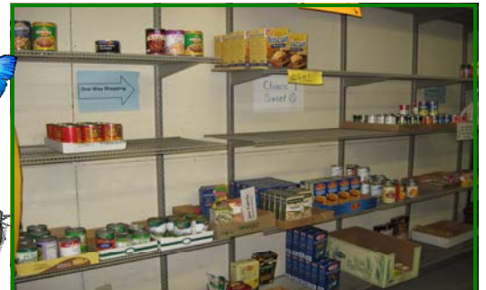
Pantry shelves after families get their groceries and supplies