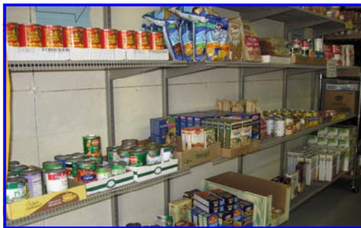
Pantry shelves before opening